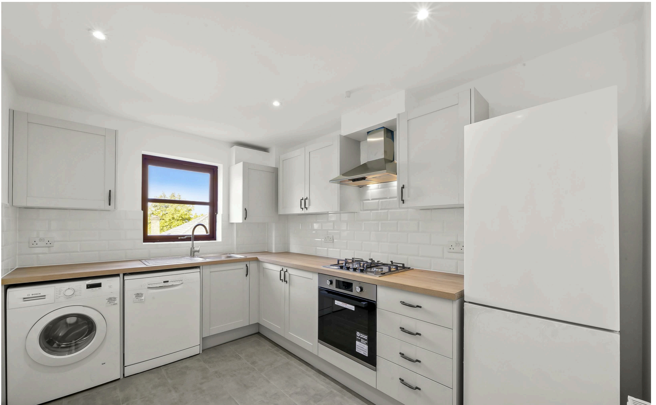
4 Lychgate Manor, Roxborough Park, Harrow On The Hill, London, HA1 3YL £2,000 Per Month