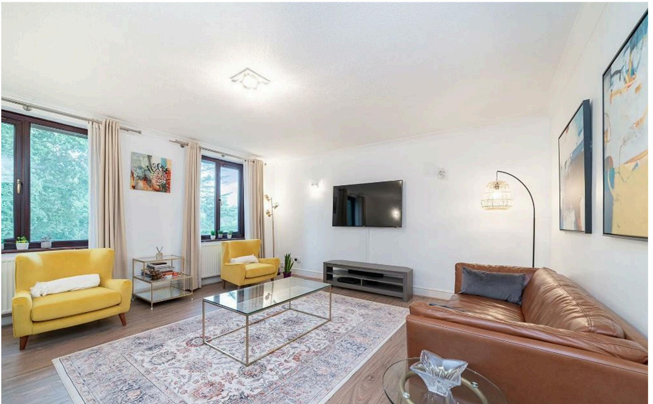
27 Harrow Fields Gardens, Harrow, HA1 3SN £2,845