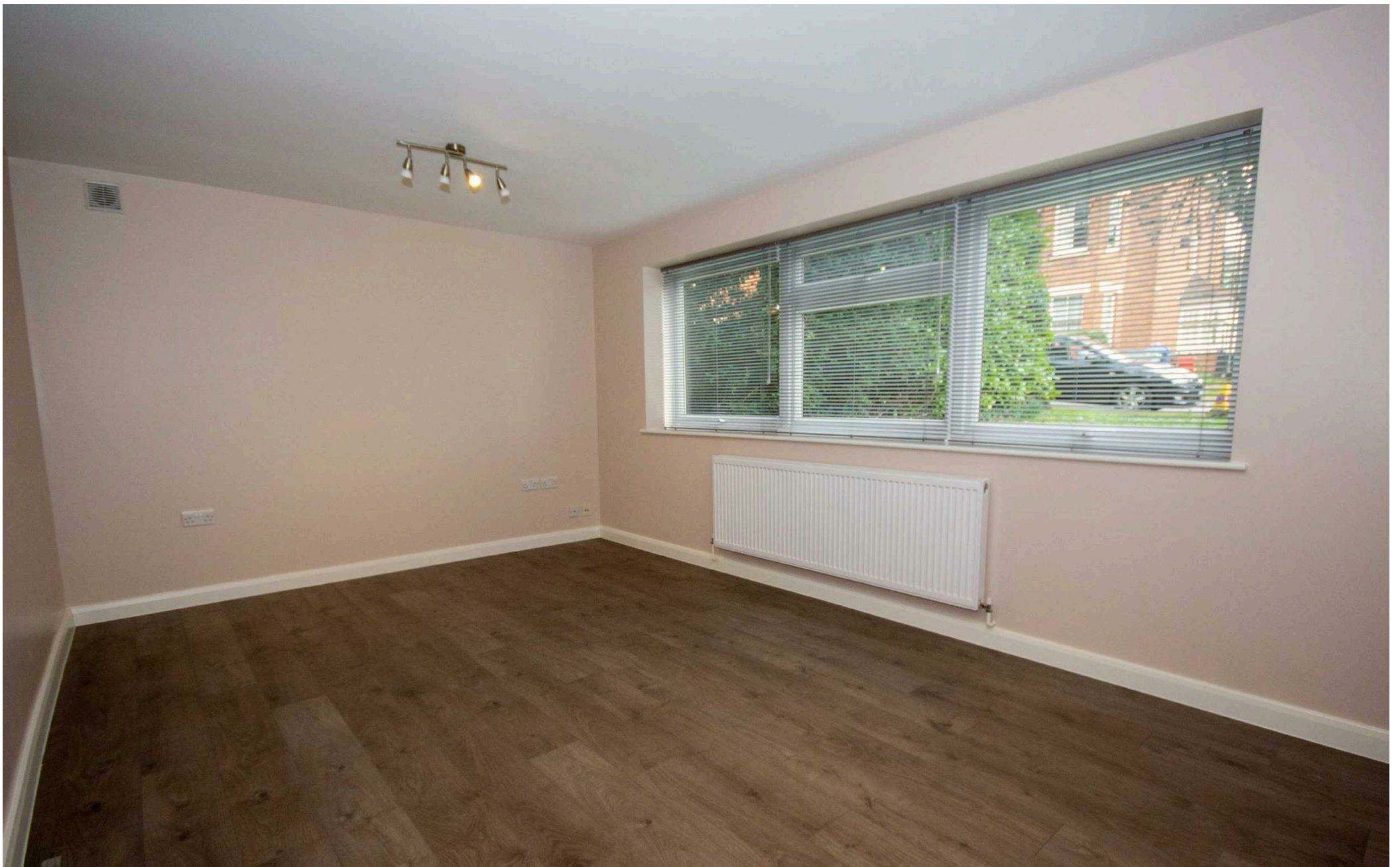
Flat 1 Rowsham Court, South Hill Avenue, Harrow On The Hill, HA1 3NX £1,775 Per Month