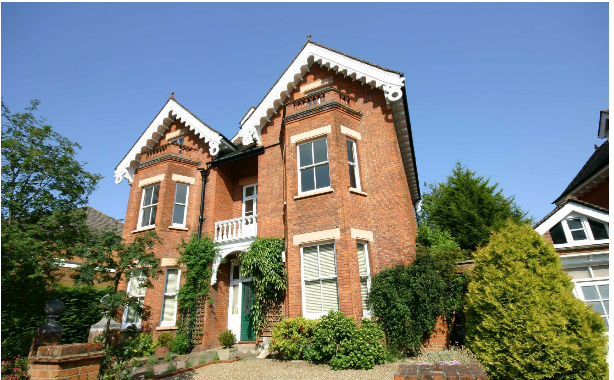
Flat 1 The Red Lodge South Hill Avenue, Harrow On The Hill, Middlesex, HA1 3NZ £2,500 Per Month